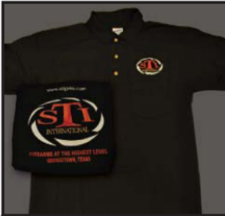
Black Golf Shirt With Pocket