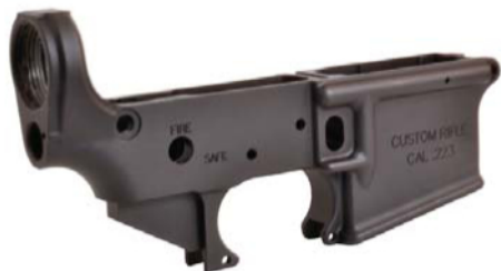
AR Lower Receiver

STI's stripped lower receiver provides an outstanding starting point for custom AR-15 style builds. Available in both .223 remington and 5.56 NATO