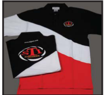
Team Shirt (Cotton)