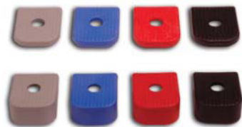
2011 Magazine Base Pads

STI's new 1911 .45 mag is stainless steel and tumble finished to ensure no sharp edges. Improved feeding, reliability, and durability are among the features.