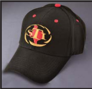
Black Cap w/ Black Bill