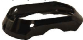
2011 Tactical Magwell Part #: 625-0230002-00

Our new 2011 Tactical magwell! Enhancements include lighter weight, side cutouts allowing ease of magazine removal during extreme clearance drills and an integral lanyard loop attachment hole.