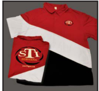
NEW! Light Weight Team Shirt