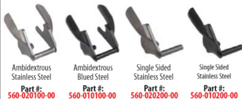
Ambidextrous Stainless Steel

Carbon steel is 4140 Stainless steel is 17-4