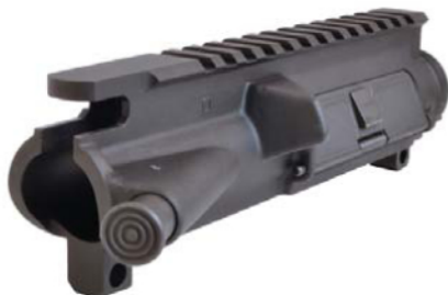
AR Upper Receiver w/ Forward Assist & Dust Cover (Also Available Stripped)

Carefully machined to Mil-Specs, the STI A3 Upper Receiver offers superior performance with the strength and durability to serve as the foundation for a true custom built rifle.