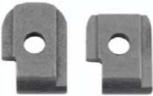
Firing Pin Stop 9/38/40 Part #: 520-38400-00 Firing Pin Stop 9/38/40 Bomar Part #: 520-38402-00 Firing Pin Stop .45 Part #: 520-45000-00 Firing Pin Stop .45 Bomar Part #: 520-45002-00

STI Firing pin stop in 4140 steel. Available standard or cut for Bomar sights.