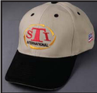
Khaki Cap w/ Black Bill