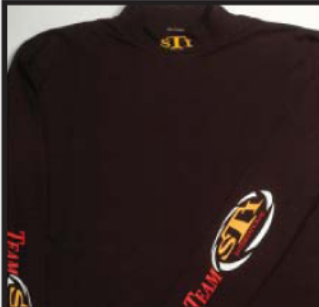
Mock Turtleneck (Black)