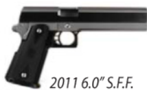
2011 6.0" S.F.F.

*Shown with: Tactical frame, Tactical slide, F&R serrations, Front dovetail Sight Cut, Novak rear Sight Cut, Flat-top Slide, STI logo