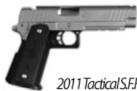
2011 Tactical S.F.F.

Standard Frame / 5" Frame / Tactical Frame / 6" Frame