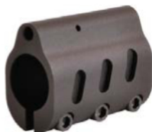
AR Unrailed Gas Block Part #: 350-0007

A simple, low profile design that can use a rifle length forearm on a carbine length barrel setup. It uses three allen head screws to clamp on to the barrel for an air tight seal.