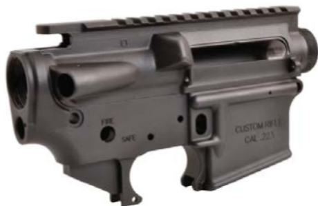
AR Upper/Lower Receiver (Matched)

Available in both .223 remington and 5.56 NATO