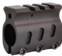
AR Railed Gas Block Part #: 350-0006

The STI quad rail handguard is one piece precision machined from aluminum, hard anodized and Teflon coated. The helical vents are engineered to maximize air flow to prevent overheating and to reduce the overall weight. Available in two lengths: competition (long), and tactical (short).