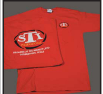
Red T-Shirt With Pocket

For European Apparel Sales, Contact Saul Kirsch: Tel: +31 416 660 464 Fax: +31 416 392 040 www.DoubleAlpha.Biz