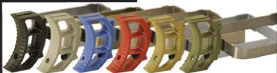
2011 Long Curved Triggers