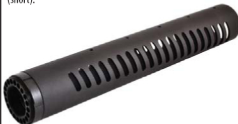
AR Valkyrie Fore End

Available in two lengths: competition (long), and tactical (short).