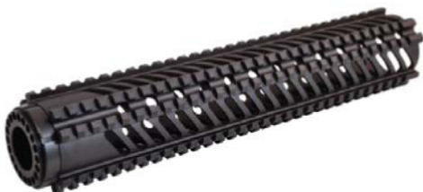
AR Quad Rail

The STI quad rail handguard is one piece precision machined from aluminum, hard anodized and Teflon coated. The helical vents are engineered to maximize air flow to prevent overheating and to reduce the overall weight. Available in two lengths: competition (long), and tactical (short).