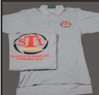
Gray Golf Shirt With Pocket