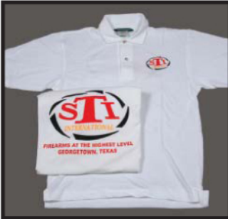
White Golf Shirt With Pocket